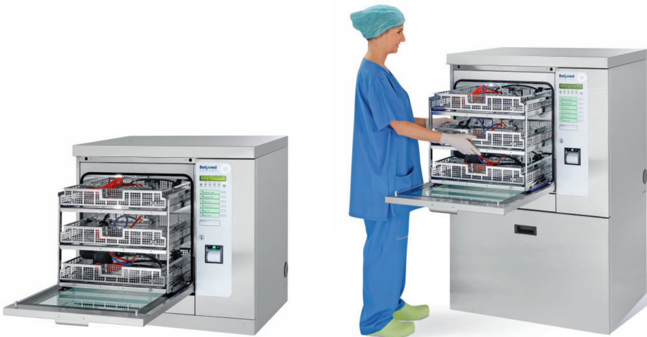
The WD 425 is available as undercounter machine (left) or mounted on a base designed to allow for ergonomic loading height (right).

As one of the leading suppliers of system solutions in the field of infection prevention, Belimed has developed the cost-effective WD 425 washer-disinfector especially for medical practices and hospitals. With simultaneous reprocessing of up to 3 endoscopes, it enables a high throughput. The endoscope channels are each individually cleaned, disinfected and dried. With its high cleaning performance the WD 425 fully meets the requirements for standard-compliance.