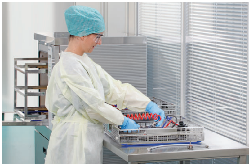
The endoscopes can already be loaded in advance, outside the machine. This saves time and costs.