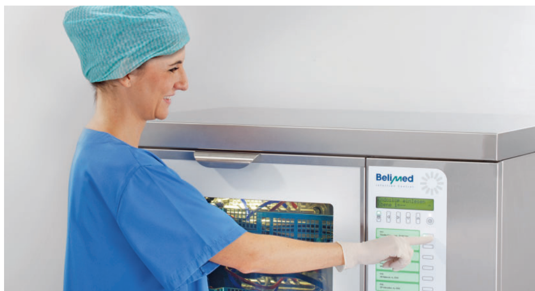
Easy and ergonomic operation: the operating panel is located at the optimal height from an ergonomic point of view.