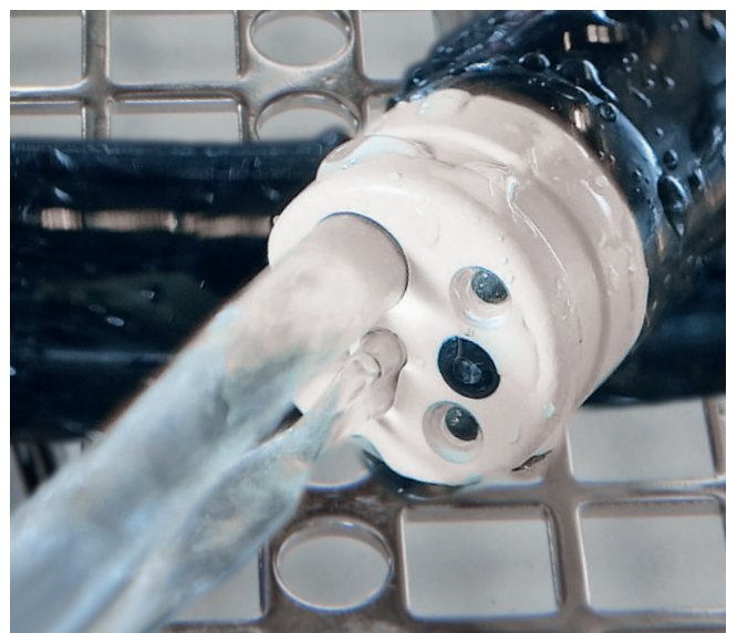
High cleaning performance: the endoscope channels are each individually cleaned, disinfected and dried.