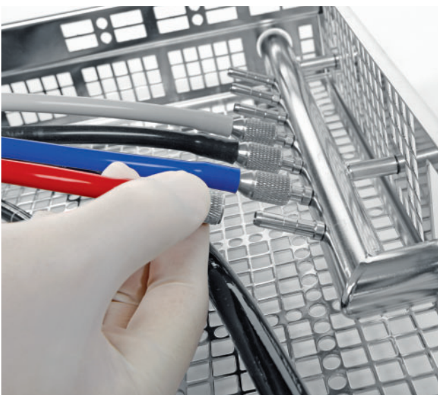
Flexible individual endoscope-channel connection concept: endoscopes from all manufacturers can be easily and quickly connected up.

The use of barcode scanners enhances the efficiency and reliability of data recording – barcodes on the endoscopes can be read in within a matter of seconds. The data is automatically recorded and documented, proving easy and effective traceability.